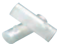
703418 Disposable Flow Transducers

SPIRO-NS-RS232 SpiroPerfect Module, CPWS, w/o 3-liter calibration syringe. Includes: CPWS spiro Software module, sensor, pressure tubing, 8 flow transducers, electronic manual, 2 training posters, and quick reference card