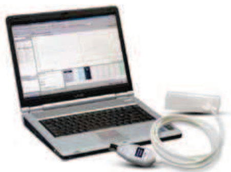
SPIRO-S SpiroPerfect® Module (Laptop not included)