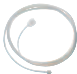
703415 Pressure Tubing