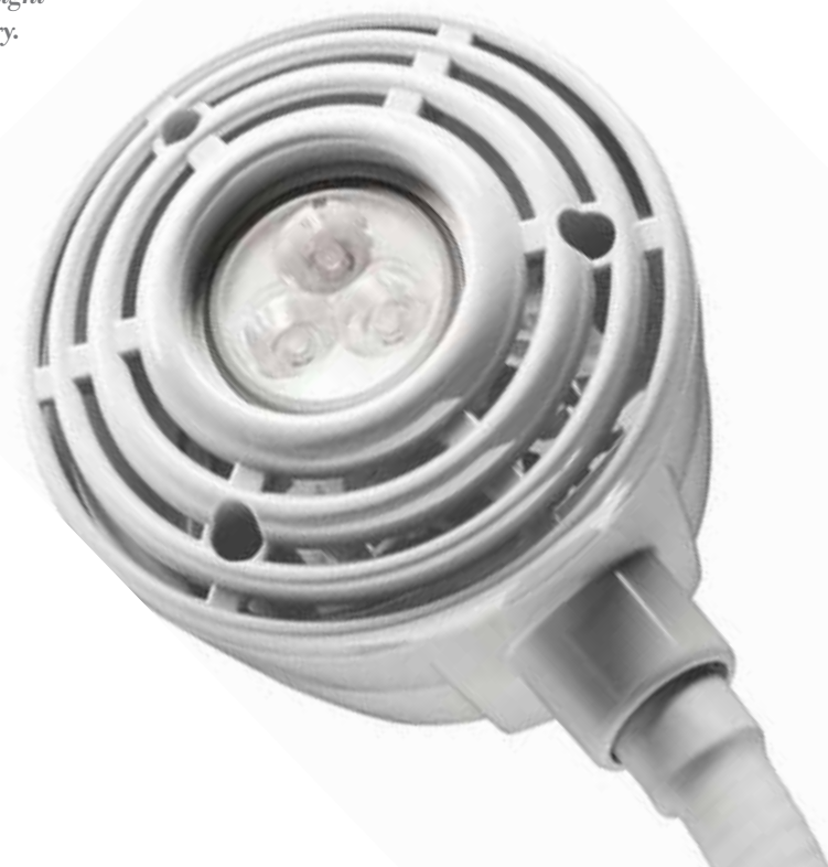
Ritter 250 LED Exam Light