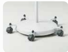
Add mobility to the 250 exam light with the optional base accessory.

The Ritter 250 LED Exam Light takes our proven exam room lighting and makes it even better by incorporating LED technology for longer life and reduced energy consumption.