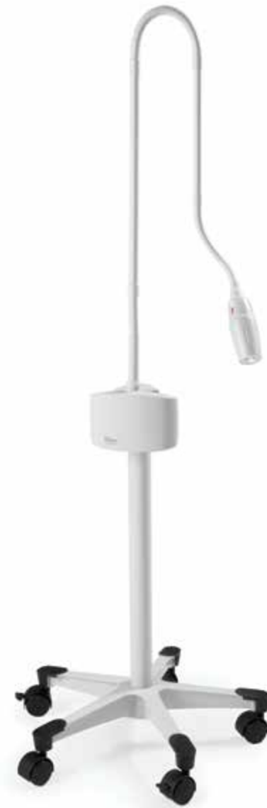
Mobile Ritter 253 LED Exam Light with caster base