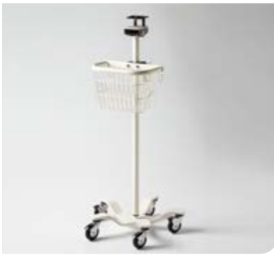
IQvitals® Mobile Cart

Giving you the tools you need to improve quality of care is so important to us. We want you to have everything you need to make the best use of your vitals device.