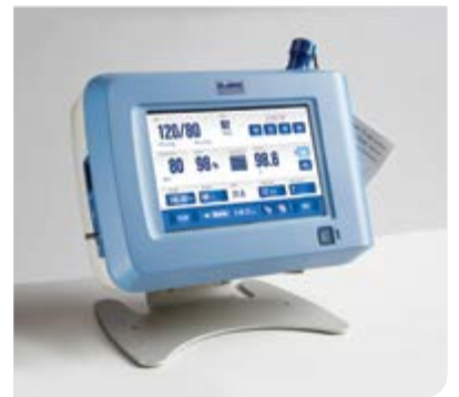
IQvitals® Countertop Mount