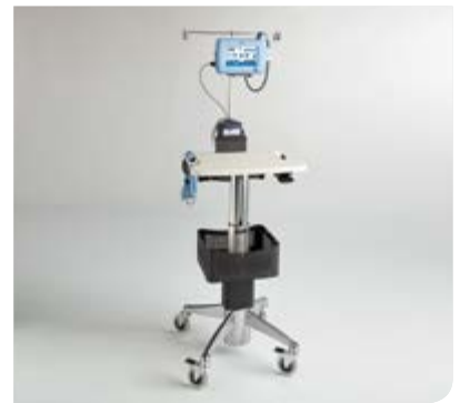
6231 Care Exchange® Workstation