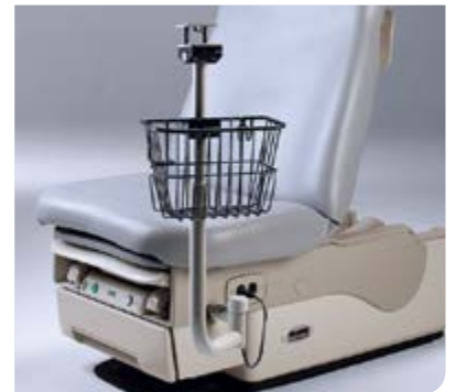
625 Table Mount for IQvitals® - Non-IQhub®