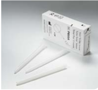
Turbo Temp® Probe Covers