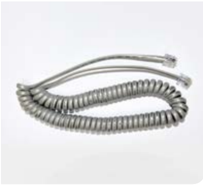
IQscale® Serial Cable for IQvitals® - 6 foot