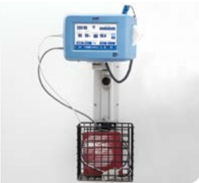
IQvitals® Wall Mount