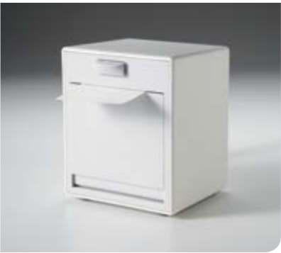
IQvitals® Thermal Printer