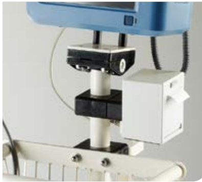
IQvitals® Mobile Cart Printer Bracket