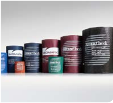
Reusable Blood Pressure Cuffs