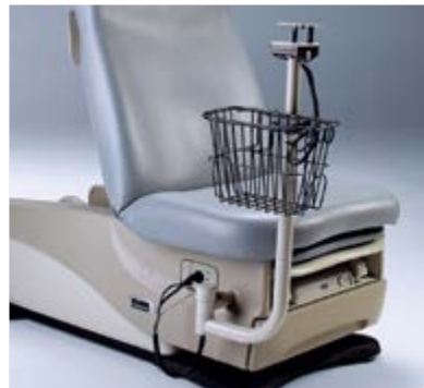
625 Table Mount for IQvitals® - IQhub®