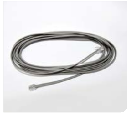
IQscale® Serial Cable for IQvitals® - 15 foot