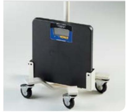
Fairbanks® Scale Mount