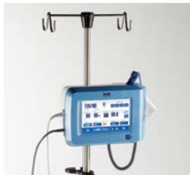
IQvitals® Equipment Pole Mount