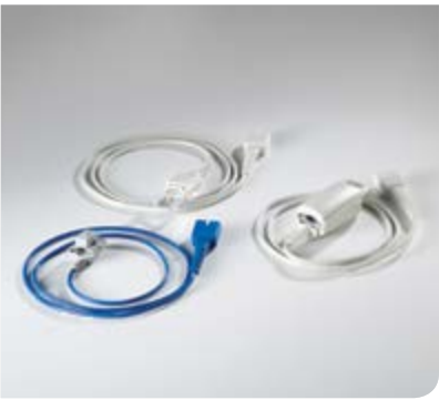
Reusable SpO 2 Finger Sensor by Envitec®