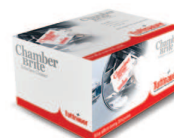
Chamber Brite Autoclave Cleaner